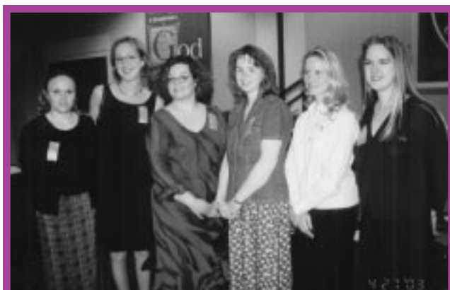
Graduate Student Inductees – 2003