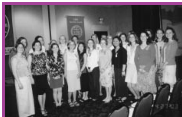
Inductees 2003 to Delta Gamma Chapter